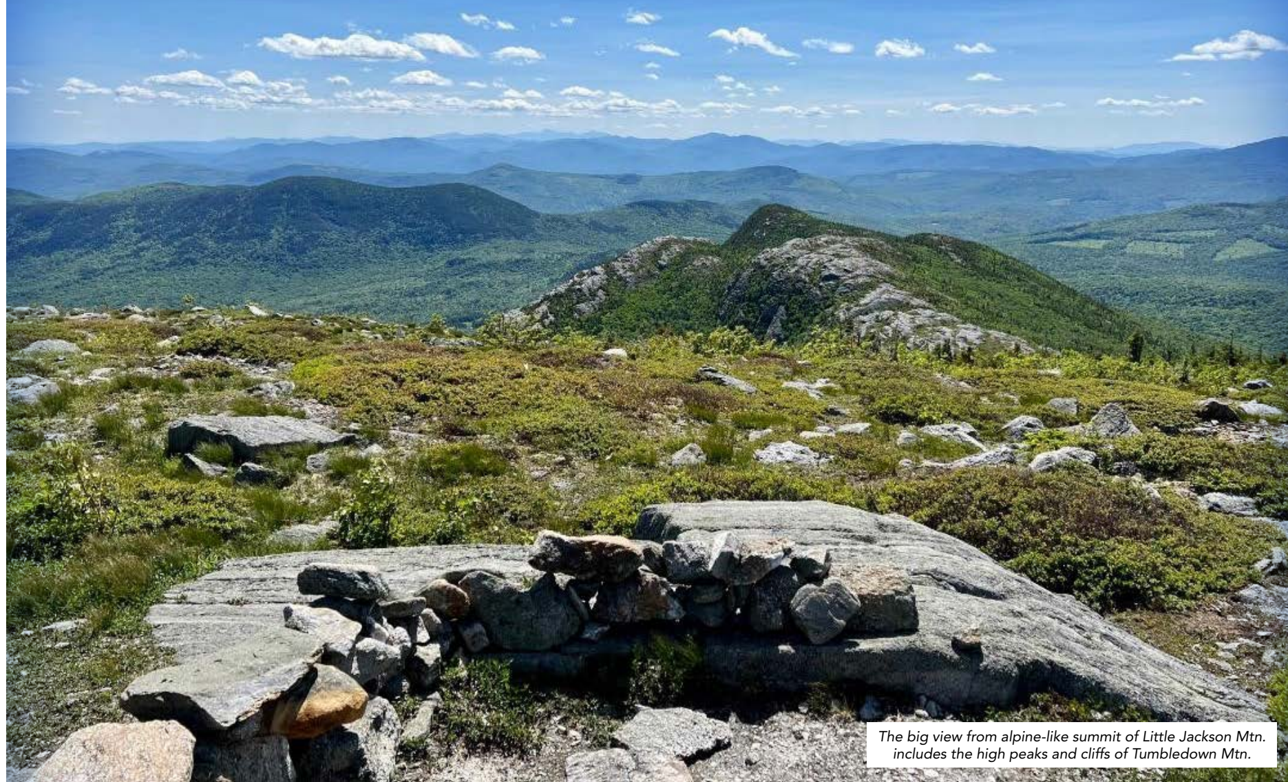
The big view from alpine-like summit of Little Jackson Mtn. includes the high peaks and cliffs of Tumbledown Mtn.

The Maine Mountain Guide , an essential companion for outdoor enthusiasts since 1961, is the only comprehensive hiking guide to the mountain trails of Maine. The 11th edition of the venerable guidebook, released in 2018, describes 625 trails on 300 mountains, from Acadia National Park to Aroostook County and Maine's White Mountains to Washington County, a hiking bounty totaling close to 1,500 miles. Here are a few suggestions for great hikes this spring to help you shake off the long winter blues. Enjoy! (By the way, the next edition of the Maine Mountain Guide will contain more mountains, trails and trail miles than ever. Look for it later this summer.)