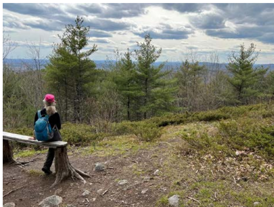
The summit of Sawyer Mtn. was once the site of a whale oil light used to guide ships into Portland Harbor.