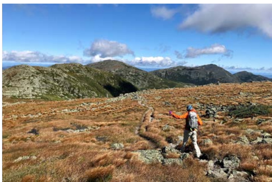
Take an all-above treeline hike around the summit of Mt. Washington, NH with Beer Hiking New England .

The selected hikes selected range far and wide across the extraordinarily diverse natural landscape of New England. Among them you'll find everything from easy pondside strolls to moderate hill walks and forest forays to strenuous mountain climbs. The majority of the hikes are loops, beginning and ending at the same trailhead, while a handful are round-trip (in-and-out via the same trail). A few hikes are one-way or point-to-point, beginning at one trailhead and ending at another.