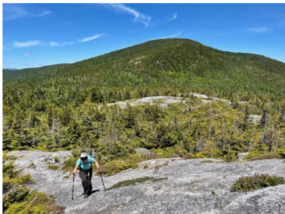
The neighboring peak of Jackson Mtn. looms over the final stretch of the hike to the top of Little Jackson Mtn.

Little Jackson is perhaps the most scenic summit in all of the 22,000-acre Tumbledown Public Lands unit. Combine the Little Jackson Connector and Little Jackson Trail for a terrific 3.7-mile hike to the wide open alpine-like summit of Little Jackson Mtn. (3,470 feet). Enjoy the awesome 360-degree panorama that ranges from the peaks and cliffs of Tumbledown Mtn. to Jackson Mtn. and far beyond. The trailhead for this out-and-back hike is on Byron Rd. Strenuous, 7.2 miles round-trip, 2,400 feet elevation gain.