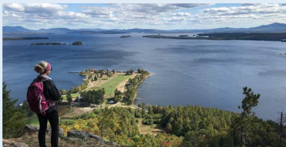
A hiker enjoys the view over Moosehead Lake from the top of the Kineo Cliffs.

Meanwhile, within a week of taking office, President Biden announced bold action to address climate change, pausing leasing of public lands for fossil fuel extraction, accelerating renewable energy development, and calling for a Climate Conservation Corps modeled on the successful CCC of the 1930's. One of his most visionary goals is conserving 30% of America's lands and waters by the year 2030. This target is the minimum amount scientists tell us is necessary to slow the loss of nature and buffer against the impacts of climate change.