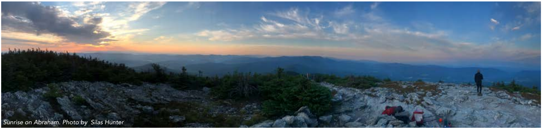
Sunrise on Abraham.