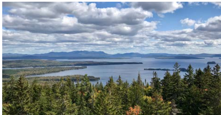
The glorious wild country around Moosehead Lake as viewed from the firetower atop Mt. Kineo.

You have the opportunity to help shape the future of the Moosehead Lake region. The Weyerhaeuser Company purchased the lands in the Greenville area formerly owned by Plum Creek