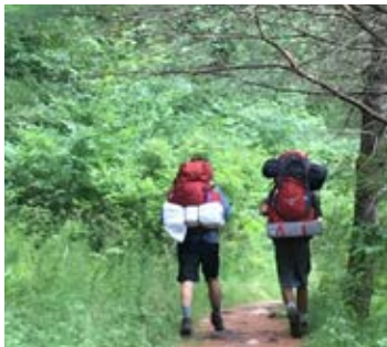
They're off!

As I watched my 16-year-old son and his friend walk into the woods at the Massachusetts/Vermont border to begin their northbound thru-hike to Canada – alone – I fought the urge to run up the trail with them. Despite my beaming smile and outward excitement, I was still conflicted about whether or not we'd made the right choice.