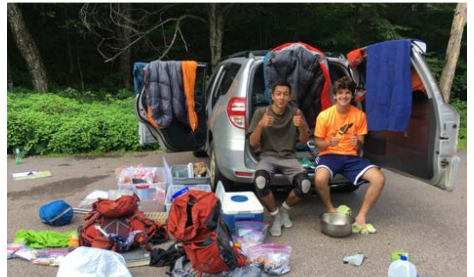
Resupply Day!

When we met them at the northern terminus of the trail on the Canadian border we were overjoyed, and so were they. They were visibly tired and sore and dirty and also thoroughly, deeply, happy.