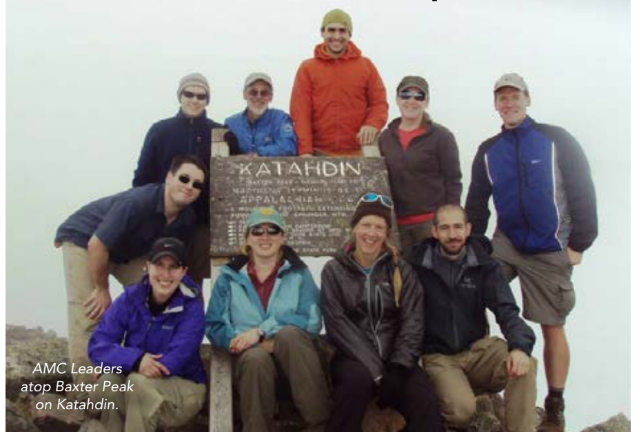
AMC Leaders atop Baxter Peak on Katahdin.

Do you like to spend time in nature? Do you want to give back? Do you want to lead trips or develop leader skills? Whether it's on the trail or on the water, you are invited to lead trips and meet people through the Maine Chapter.