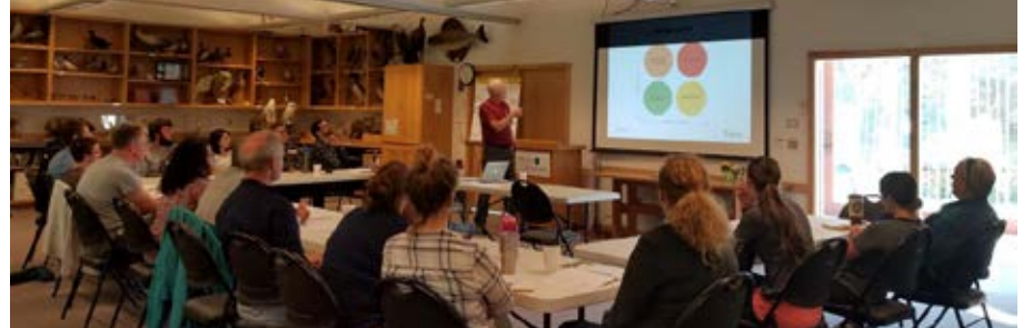
2019 AMC Maine Chapter Leadership Training.