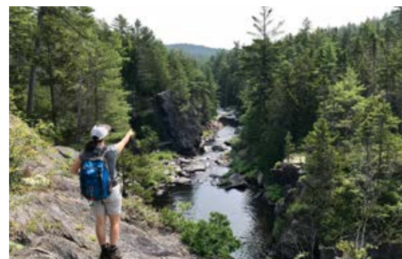
A hiker enjoys a look at Gulf Hags, the “Grand Canyon of Maine” on the West Branch of the Pleasant River, not far from AMC’s Little Lyford Lodge.

As a central theme to AMC’s upcoming 150th anniversary, the concept of “Active Conservation” is—to me—an exciting opportunity to amplify our message that Conservation is a living and breathing heartbeat of the organization. It is my hope that together by fostering a love of wild places (especially those close to home), by stepping up to do the Preservation to ensure these areas are given a chance to heal, and by participating in Restoration perhaps we can leave the planet a little better off than we found it. Who knows, maybe all this CPR might save us too!